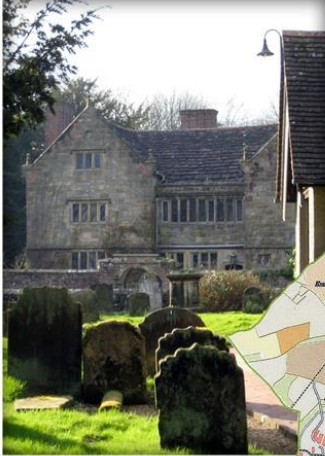
Manor House from St Margaret's Church, West Hoathly