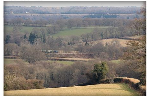
View South-East from All Saint's Church, Highbrook with Bluebell Railway