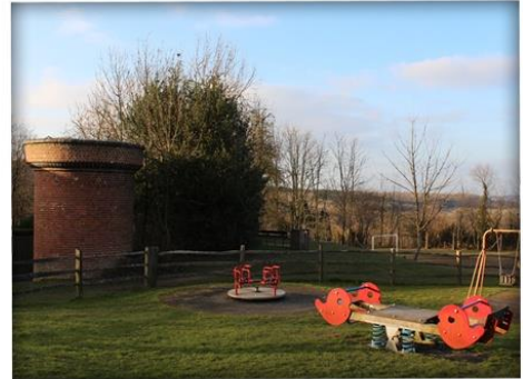
Sharpthorne playground, railway tunnel airvent and views North