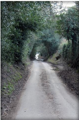
Green tunnel along Cob Lane